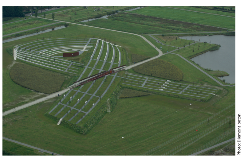
The National Monument MH17 consists of a green tree ribbon and a memorial and is about 2 hectares in size.

The National Monument MH17 in Vijfhuizen honours the victims of this disaster and keep the memory of them alive, as a symbol of hope, faith and reflection. In the park-like environment you will find 298 trees. Lime trees, ironwood, ash, hawthorns, pines and ornamental apples, planted by relatives. Shoulder to shoulder, a lasting memory.