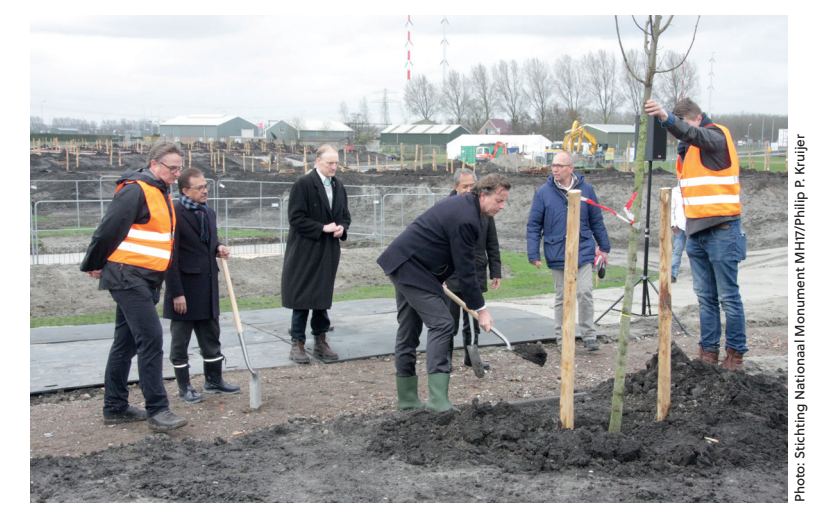
On the 18th of March 2017 the Dutch Minister of Foreign Affairs, the chairman of the Surviving Relatives Foundation, Malaysia's ambassador and Malaysia Airlines's CEO plant a tree for the captain of flight MH17.

Ten different tree species have been planted for the passengers. The variety of trees means that there is something new to experience every season. The chosen species also emphasise the diversity of the deceased passengers. For the crew of flight MH17 a separate kind has been chosen: lime trees. These are in front, on the edge of the amphitheater.